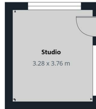
Studio 3.28 x 3.76 m