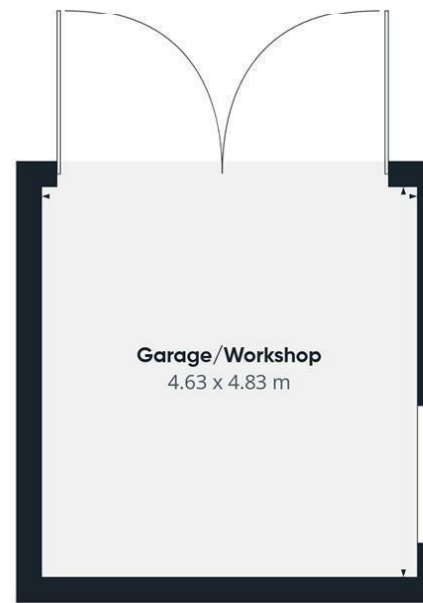
Garage/Workshop 4.63 x 4.83 m